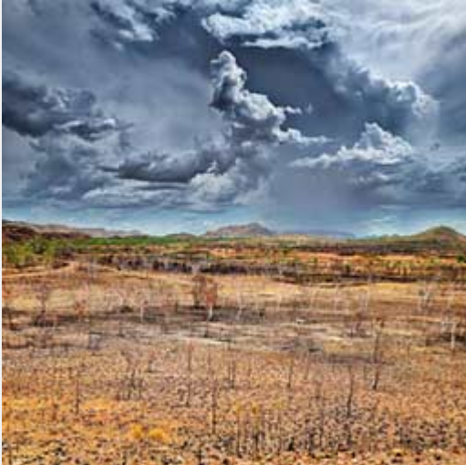
NORTH 1 2015